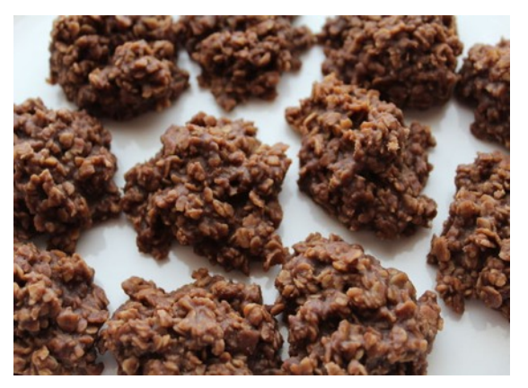
Yields about 48 cookies

Remove to wire rack to cool completely. Store in an airtight plastic bag or tin.